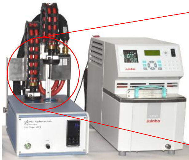
mobile Cold Finger mCF2 with thermostat