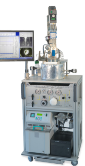
GHA 350 with 3 cameras in compact trolley