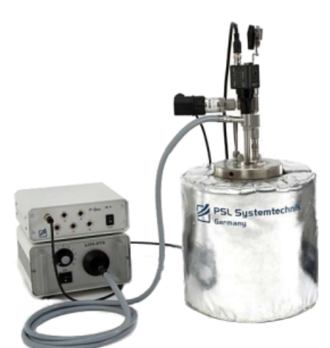
Gas Hydrate Autoclave GHA 200

Up to 6 hydrate cells can be operated simultaneously via PC software. With boroscope cameras gas hydrate formation can be visually observed. The GHA 200 has one top view camera or alternatively an overhead stirrer, the GHA 350 offers three cameras (1 top view, 2 side views at different heights) and simultaneously the overhead stirrer. Photos and videos can be taken during tests. For sour gas testing all autoclaves are available as Hastelloy<sup>®</sup> model including all wetted parts.